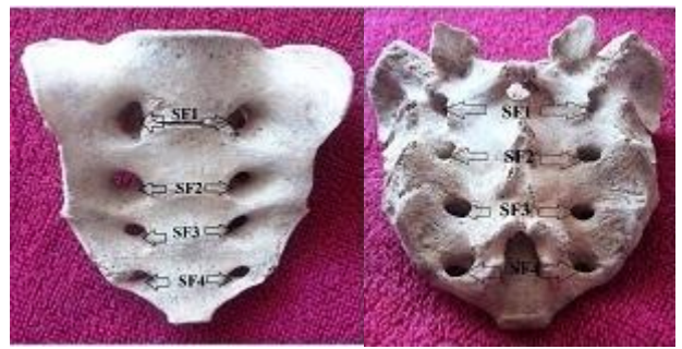
Figure-1: Normal Sacrum – Anterior & Posterior View (Sacrum with four pairs of sacral foramina)

segment sacrum, whereas reduction of sacral constituents is less common.<sup>[2,5,6]</sup> Sometimes fifth lumbar vertebra may fuse with the first sacral vertebra (Sacralization of L5) or first coccygeal vertebra may fuse with the apex of sacrum (Sacralization of coccygeal vertebra).<sup>[4]</sup> Both condition leads to formation of five pairs of sacral foramina.<sup>[6]</sup>