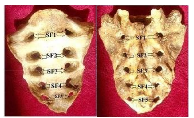
Figure-3: Sacrum with five Pairs of Sacral Foramina and Complete Bilateral Sacralisation of first Coccygeal Vertebra – Anterior & Posterior View